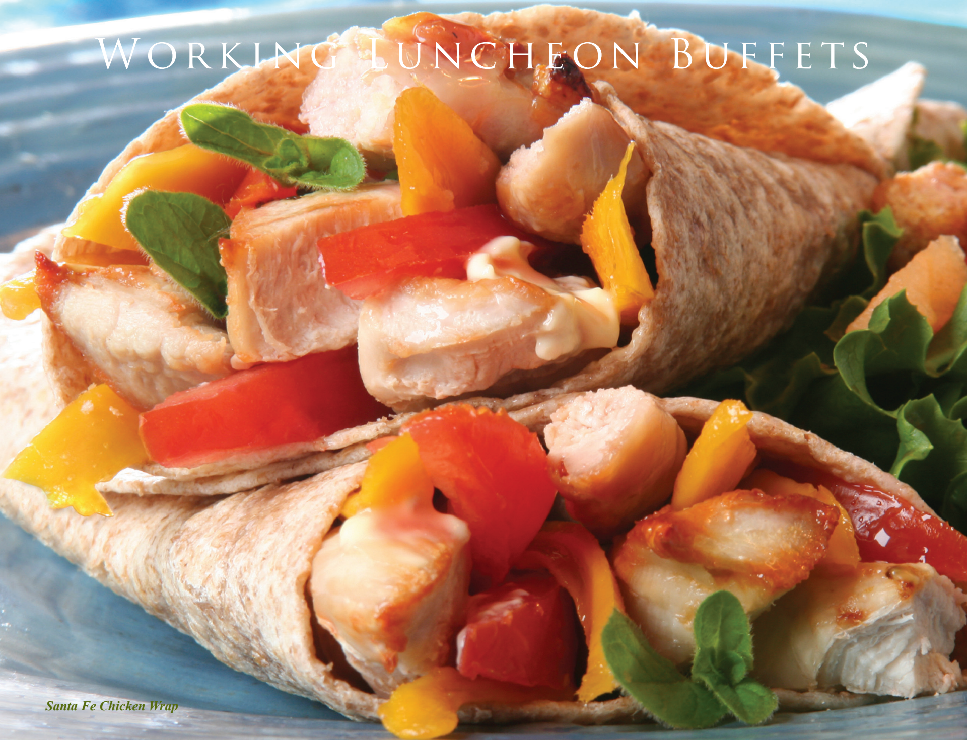
Santa Fe Chicken Wrap