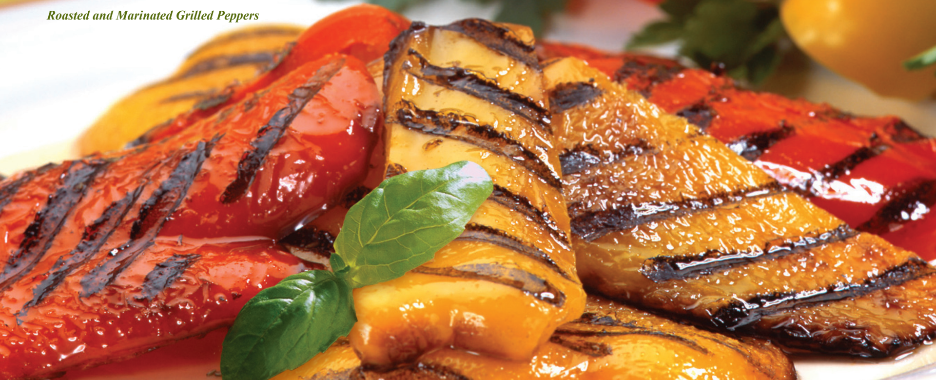
Roasted and Marinated Grilled Peppers