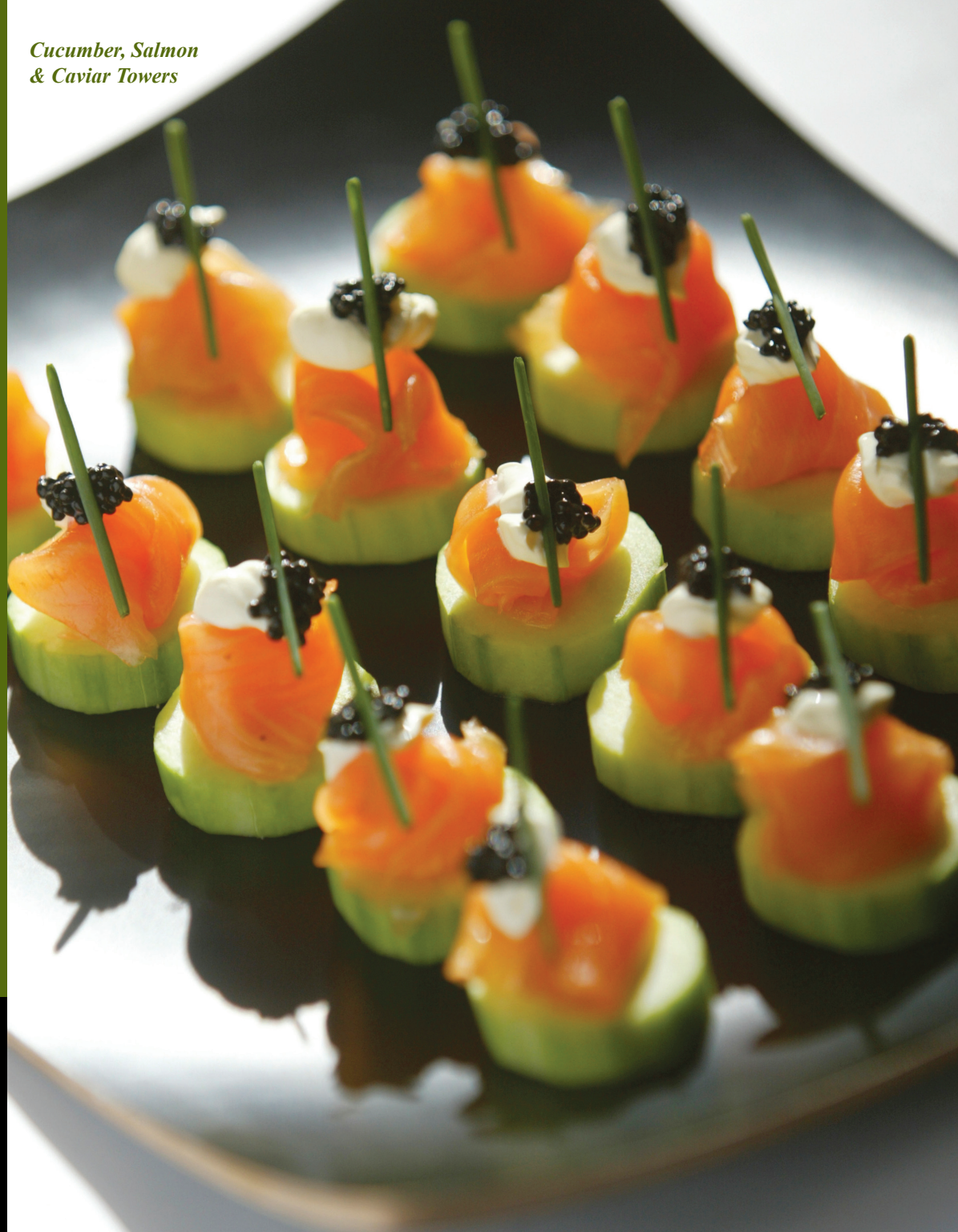
Cucumber, Salmon & Caviar Towers

At AVI Fresh, there truly is only one way... the fresh way. "Fresh" is not a catch word or motto to us, it's our culinary foundation. The freshest meats, the freshest produce, the freshest ingredients and the freshest spices, combined with the freshest culinary minds we can find, consistently create culinary works of art. From the visual beauty to the intoxicating aromas, the crispness of the textures and the succulent flavors, your every sense will experience what fresh truly is. We invite you to sit back, relax and indulge in the culinary arts like never before... Enjoy!