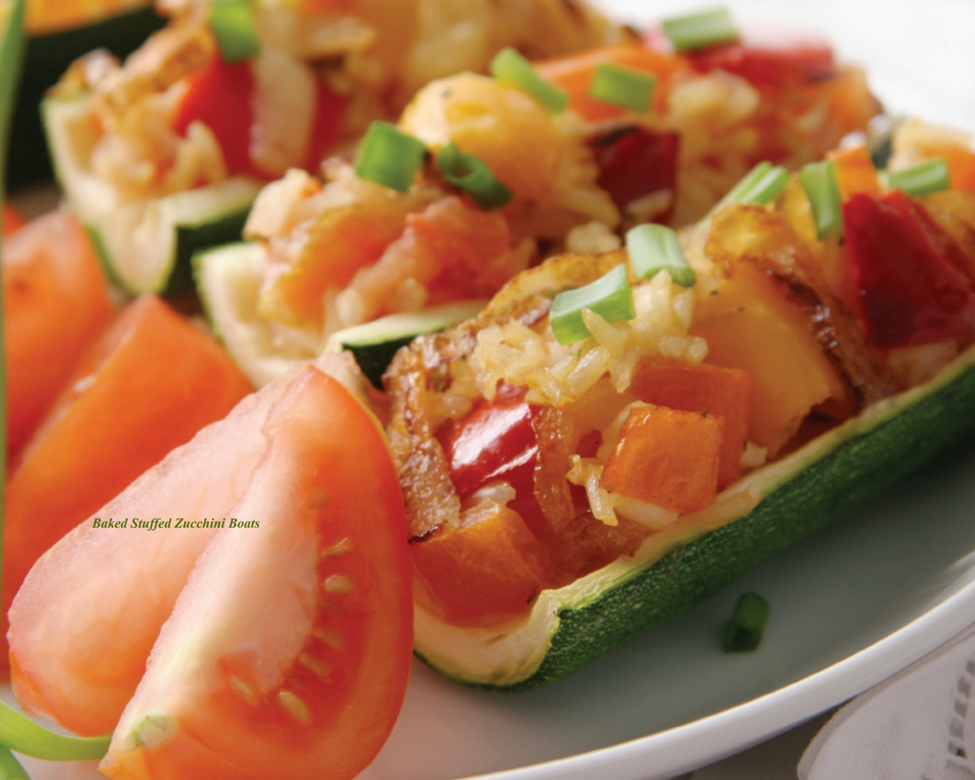
Baked Stuffed Zucchini Boats